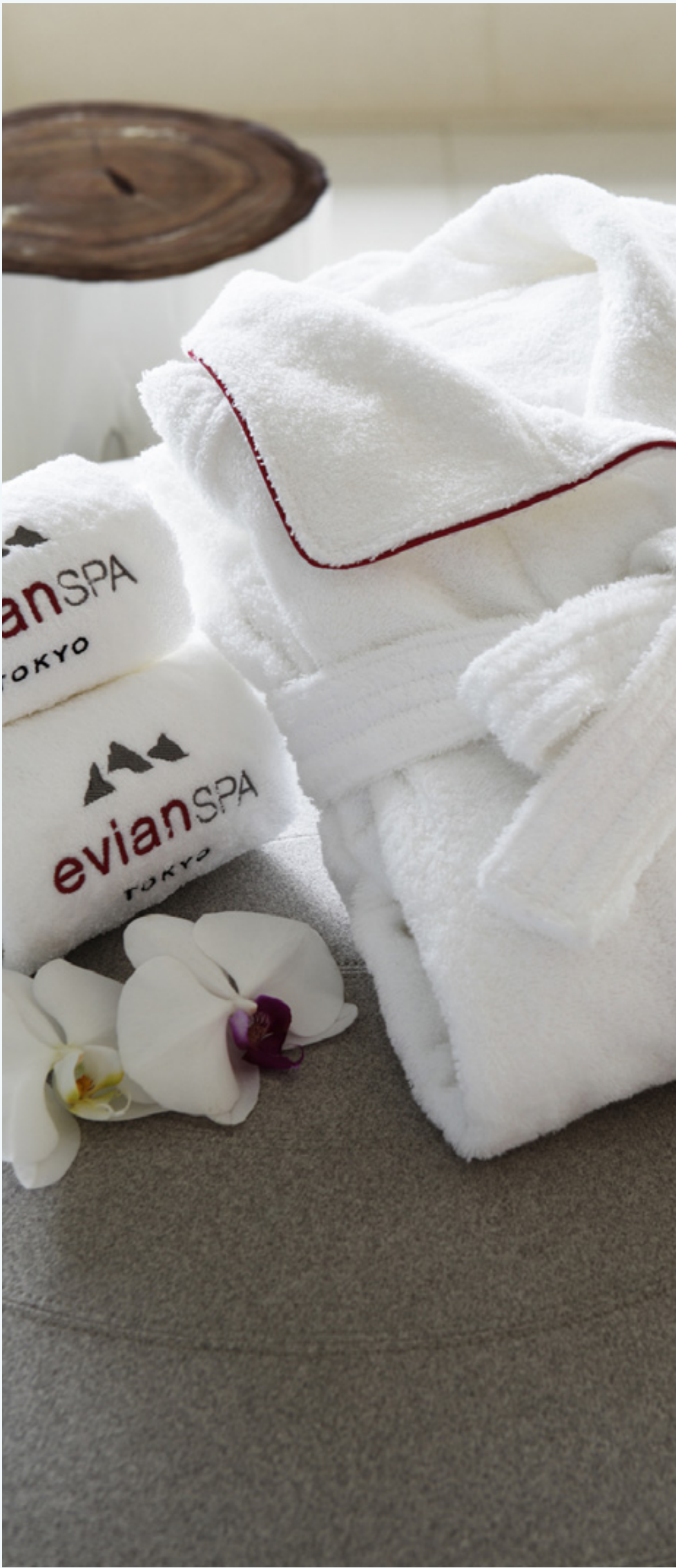
BESPOKE EVIAN® SPA ITEMS.