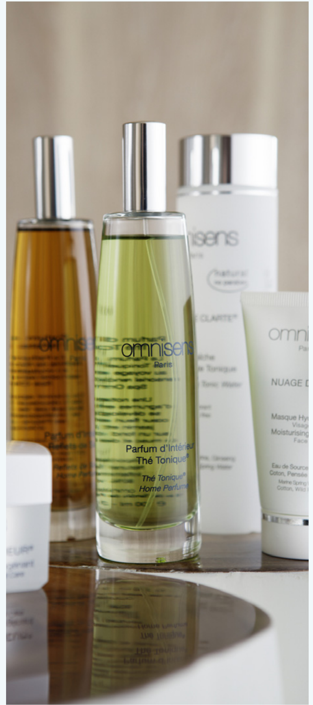
SPA PRODUCTS BY OMNISENS, PARIS.