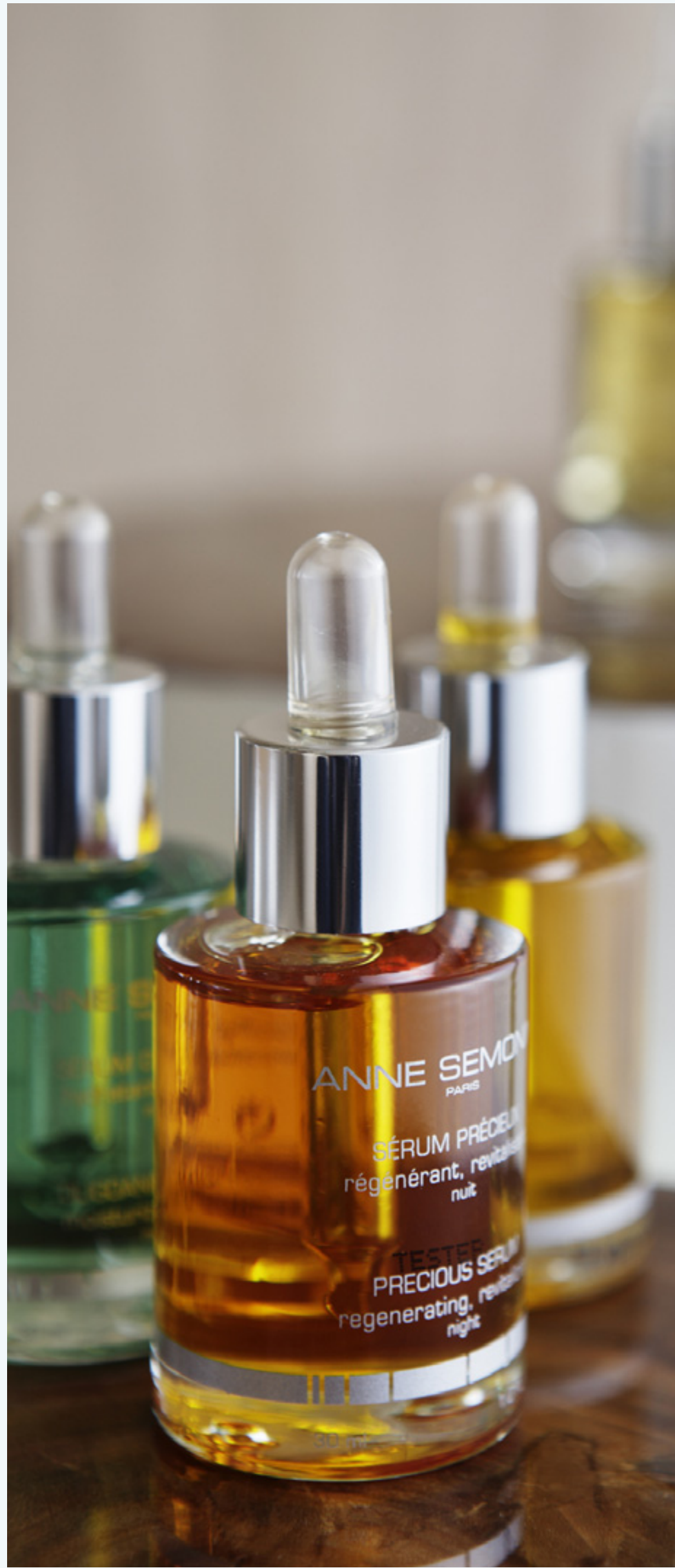
SPA PRODUCTS BY ANNE SEMONIN, PARIS.